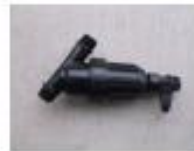
Item GSW-16 Description Filter, w/stainless steel screen