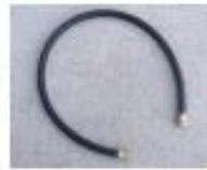
Item GSW-11 Description 4 Ft. Flex Hose