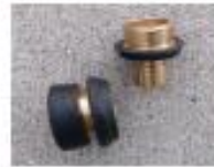
Item GSW-14 Description Quick Connector Set