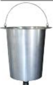
Item GSW-53 Description 2 1/2 Gal. Waterer Bucket w/Handle