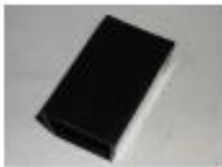
Item GSW-07 Description Float Protector Standard