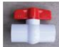
Item GSW-17 Description Shut-Off Valve