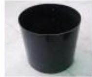
Item GSW-54 Description Heat Tube Extender