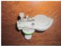
Item GSW-06 Description (No Float) Automatic Fill Valve Standard Item